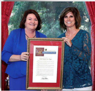
Award Winning Service to Seniors