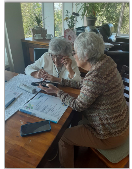
Tech support volunteers bridge the digital divide