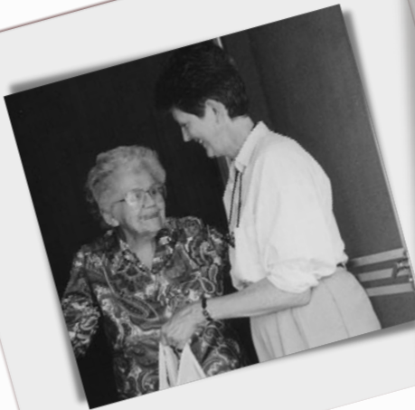
Grocery Delivery Past