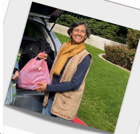
Grocery Delivery Today